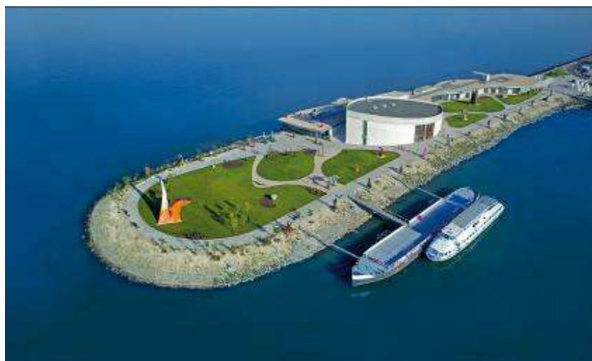
Meulensteen Art Museum Danubiana, Bratislava - Čunovo