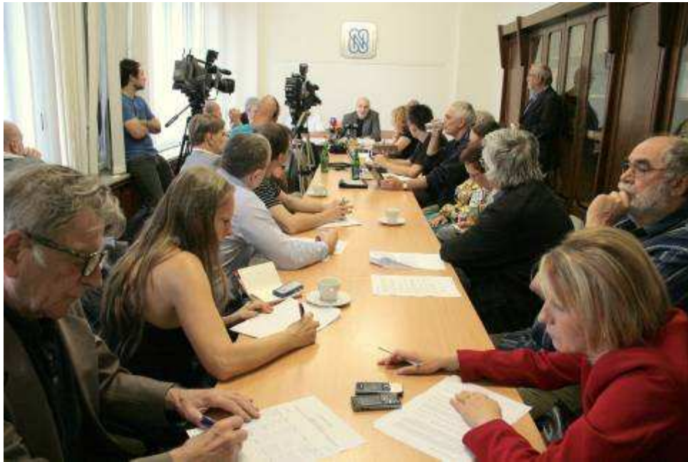
The first press conference

- The initiative for changing the proposal of the tax and social system reform (May 2011 – October 2011) was one of the most important SUVA and SCCD activities. It was a part of our long-term effort to improve the legal and social status of artists in Slovakia. We had got enormous support from Slovakia's artists and eventually achieved partial results. Our international partners also supported us in our activities. An extensive report of more than 50 pages concerning the initiative is available at webpage of IFCCD, Canada: http://www.ficdc.org/cdc2081 .