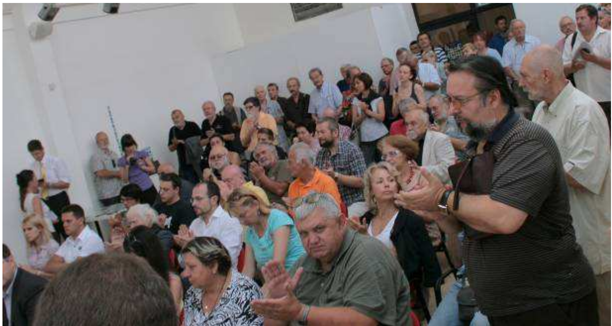
Protest meeting of artists at Gallery of Slovak Union of Visual Arts