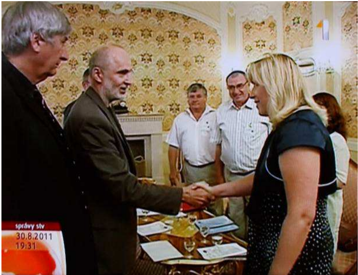
Main TV News: meeting of representative of artists and a small business with Prime Minister