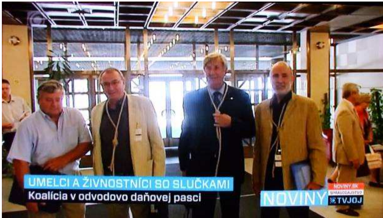
Headline on screen: Artists and entrepreneurs with loops (symbol of protest), evening TV news The report about the protest of artists in Parliament

- Day of Art 2011, September 13th: Performers from various artistic fields (musicians, actors, visual artists, writers, translators) joined their forces in a program that was running concurrently on 5 stages in the historical center of Bratislava for 6 hours. The event was organized under the auspices of Bratislava's Mayor within the campaign that was supporting demands of the SCCD regarding the discussed tax reform.