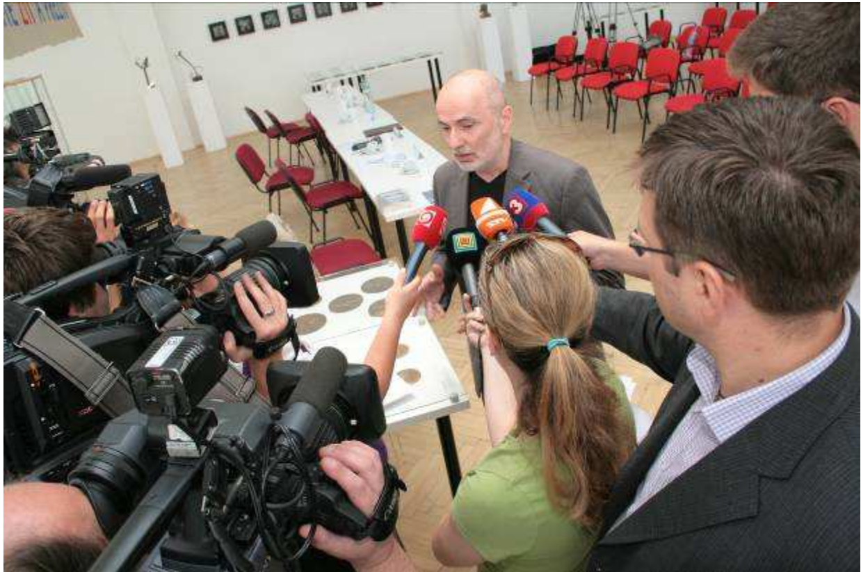
Journalists interested in actual information about the protest of artists