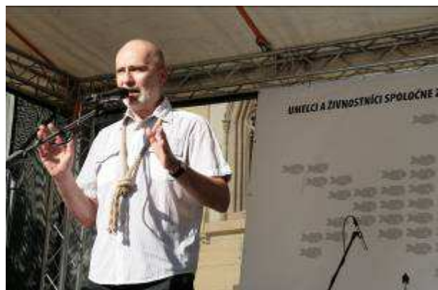
Opening of the protest event of artists at Main square in the center of Bratislava